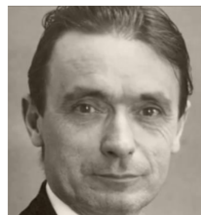
Rudolf Steiner, PhD 1861-1925 Author of "The Philosophy of Freedom" and Founder of Waldorf Education